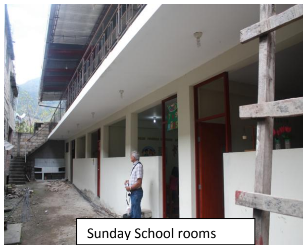
Sunday School rooms