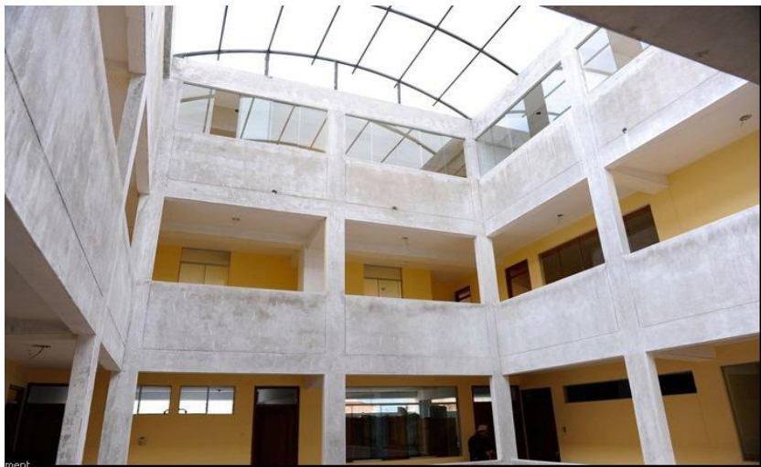
Inside view of Elim Orphanage