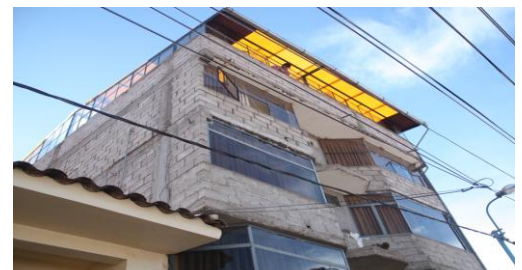
Talitha Cumi 1

God spoke and in September 2004, two members from our church returned to Peru with money to purchase a girls' house. Talitha Cumi (little girl get up) was founded and now has 15 girls. The 5-story building has dorm rooms for girls and 3 apartments for volunteers and mission teams. Each apartment has 3 bedrooms, bath, and common area.